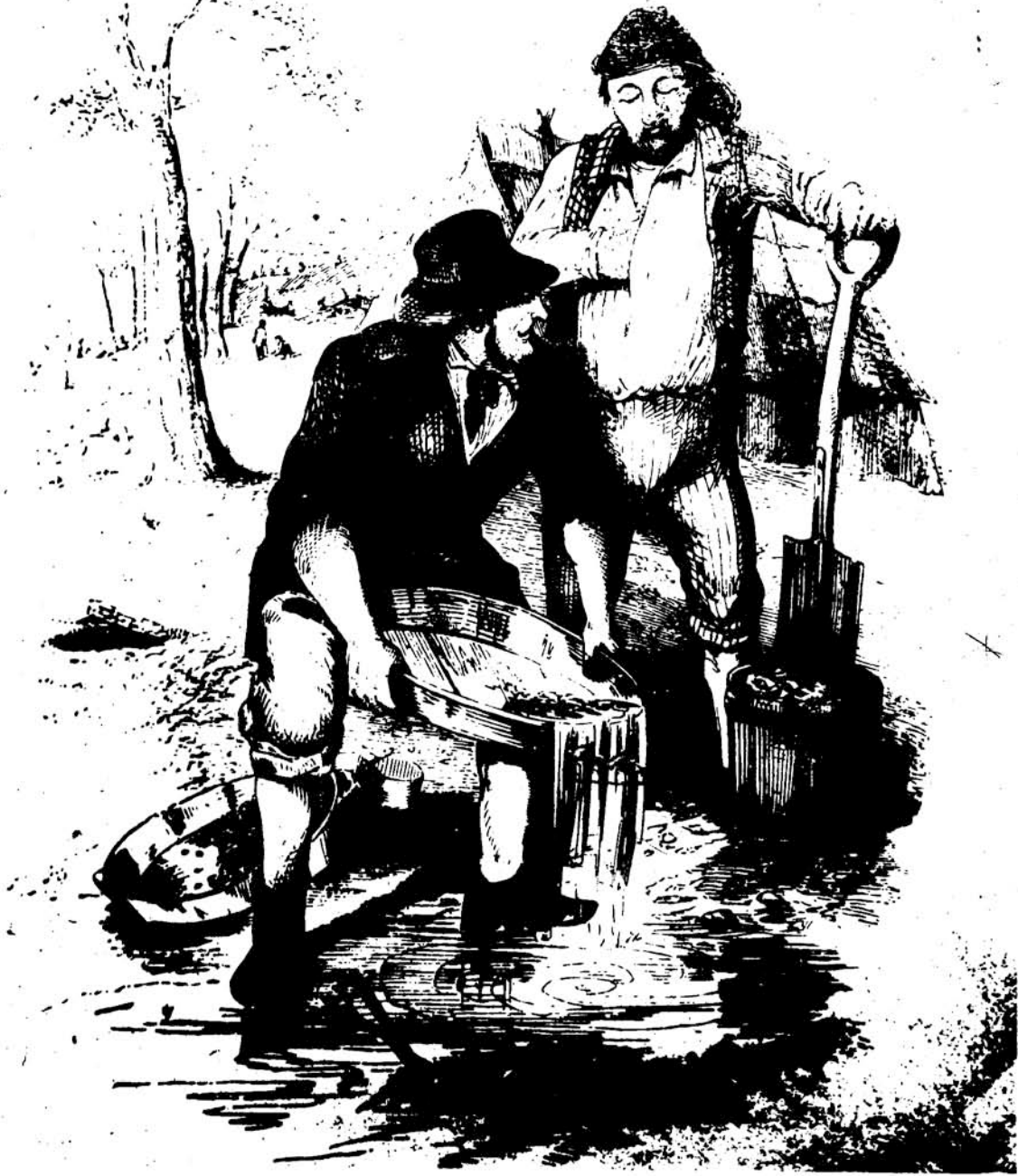
GOLD PANNING IN THE 19TH CENTURY